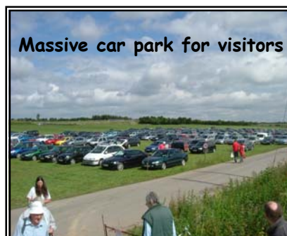
Massive car park for visitors