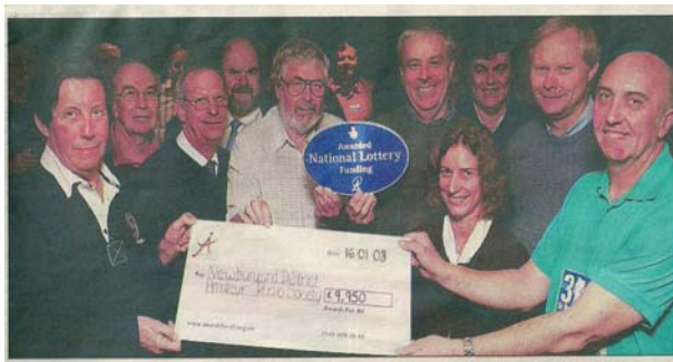
Members of Newbury and District Amateur Radio celebrate receiving an Awards for All grant