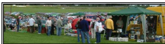
Traders plots as far as the eye can see !