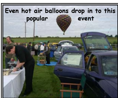
Even hot air balloons drop in to this popular event